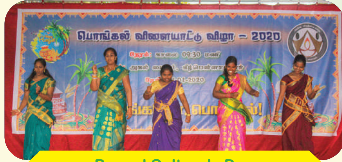
Pongal Cultural's Day