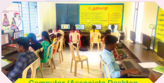
Computer (Associate Desktop Publishing - DTP)