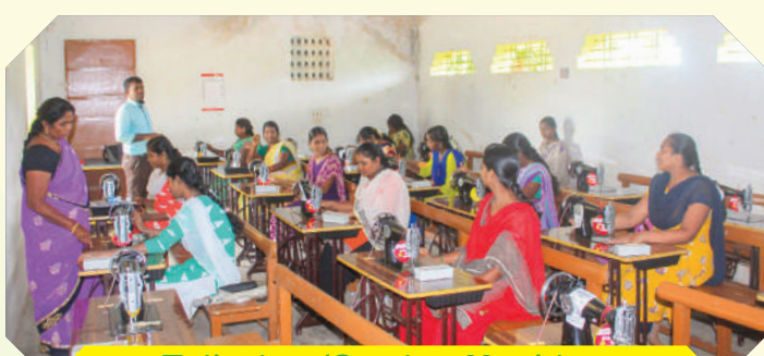
Tailoring (Sewing Machine Operator)