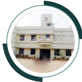
AHAL - Action for Human Rights and Liberation centre at Kilpennathur (1999)