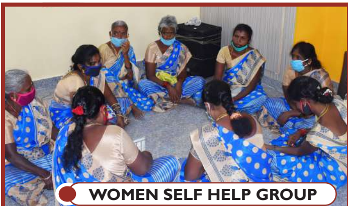
WOMEN SELF HELP GROUP