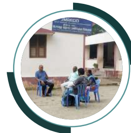
JMAADD - Jesuit Ministry to Alcohol and Drug Dependents in Kuppayanallur (2011)