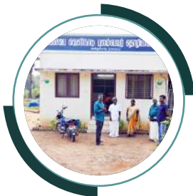
JMMEx - Jesuit Migrant Ministry External in Kasthambadi (2014)