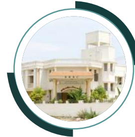
DHRC Dalit Human Rights Centre Chengalpet (2003)