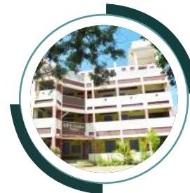
LIFT Loyola Intergral Formation Training Centre at Harur (2015)