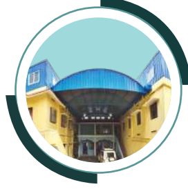
PARAN - Pedagogy and Action for Rights of Adivasis at Makkampalayam (2013)