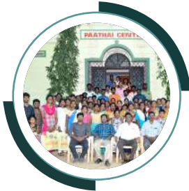
PAATHAI - Training Centre at Vallam in Chengalpet (1996)

To identify and uplift the lives of the vulnerable sections, the Jesuit Chennai Province works in 14 different places through the following Social Action Centres: