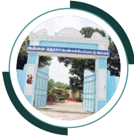
Mother Teresa Women Empowerment Centre at Pondicherry (2011)