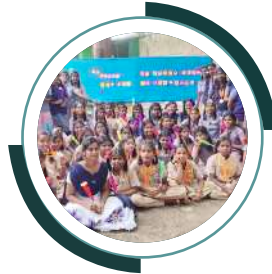
Fr.Ceyrac Girls Hostel Tindivanam (2007)