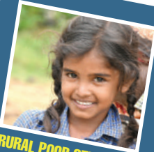
RURAL POOR STUDENTS